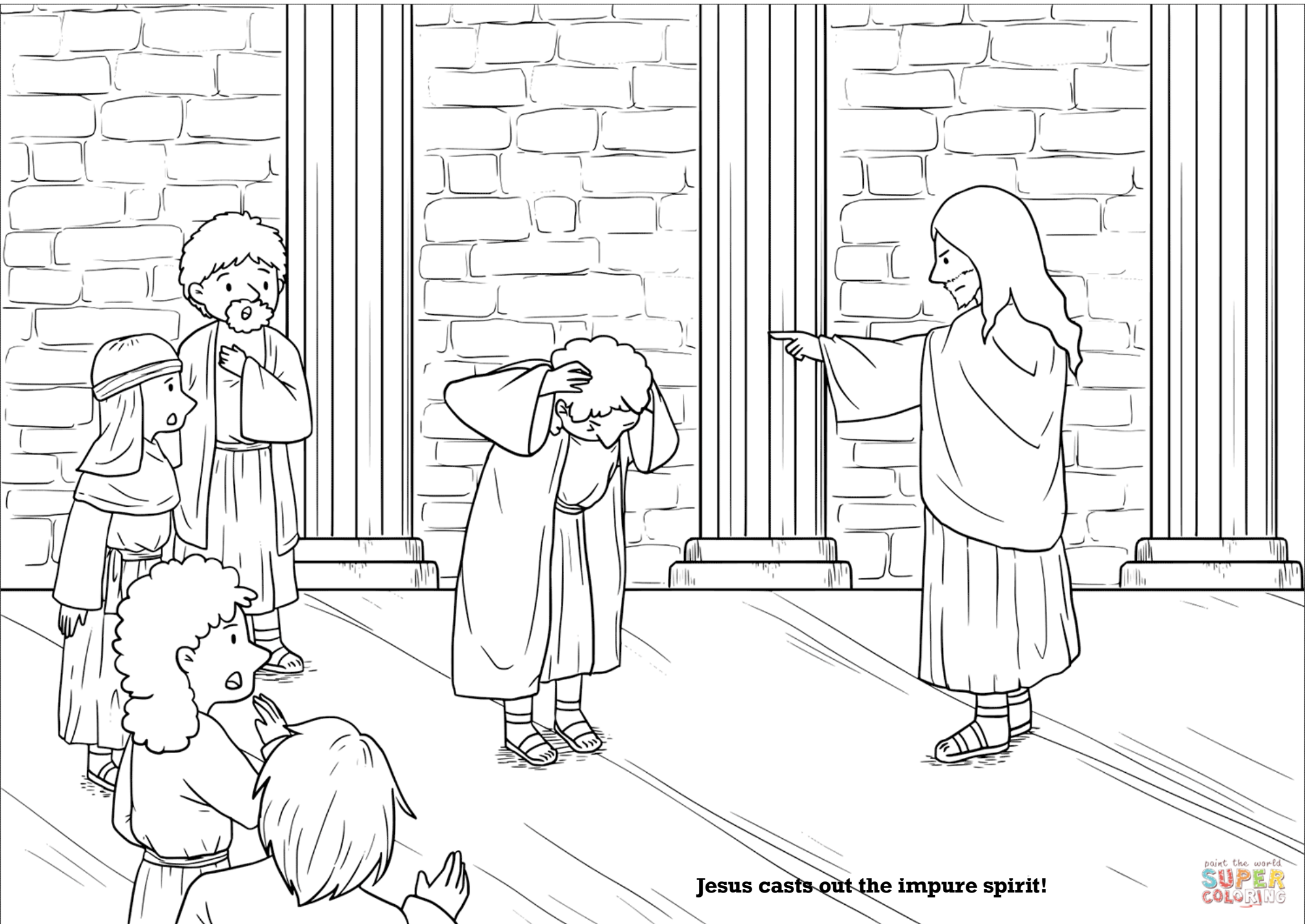
Jesus casts out the impure spirit!